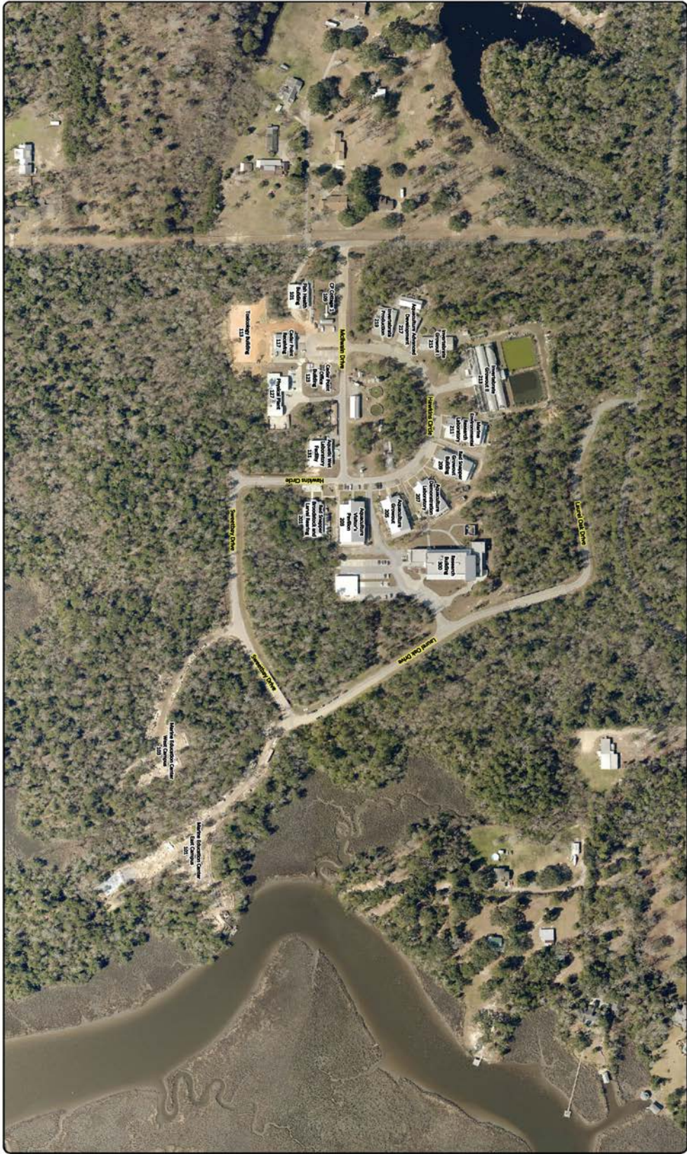
GCRL Cedar Point Campus

GCRL/CPLR: Some buildings shown may have been built by previous owners of the land. The City of Ocean Springs does not warrant the accuracy of the information shown on this map. The City of Ocean Springs does not warrant the accuracy of the information shown on this map. The City of Ocean Springs does not warrant the accuracy of the information shown on this map. The City of Ocean Springs does not warrant the accuracy of the information shown on this map.